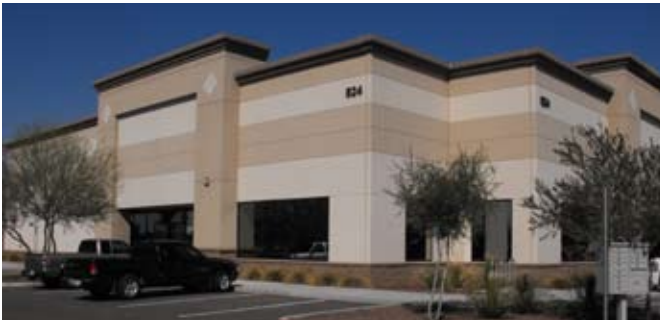
Facility in Avondale

The program in Avondale is located at 824 N. 99th Avenue, Avondale, AZ 85323.