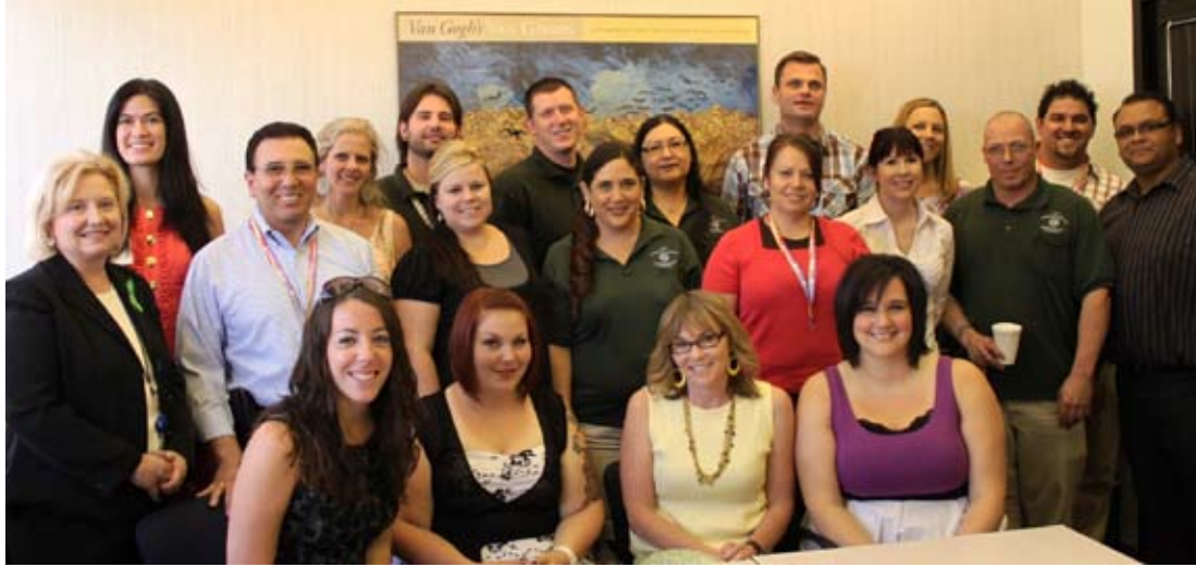
Community Bridges ASIST trained staff at the Center for Excellence in Phoenix.

for all Applied Suicide Intervention Skills Training (ASIST) trained staff. CBI is grateful for this recognition in exceeding our training goal of offering ASIST to over 200 staff working throughout Maricopa County.