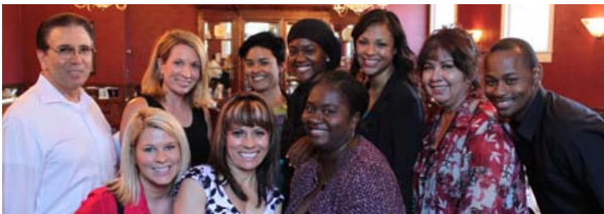
This event brought Community Leaders together and has created new relationships with the Alliance in an effort to "Build a Better Mesa", together.